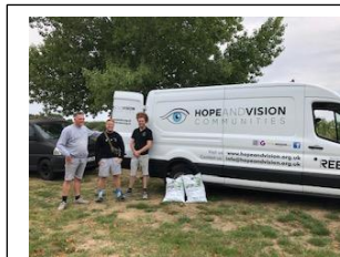
Hope & Vision