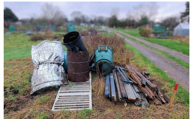
Rubbish cleared by the committee from a vacant plot.

Since the start of this year, 40 plots have been made available available and are being shown to people on the waiting list. The committee has worked to clear many of these plots to make them easier for new owners to manage and get started quickly!